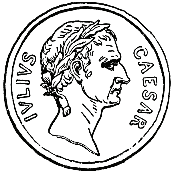
COLOUR IN THE JULIUS CAESAR COIN